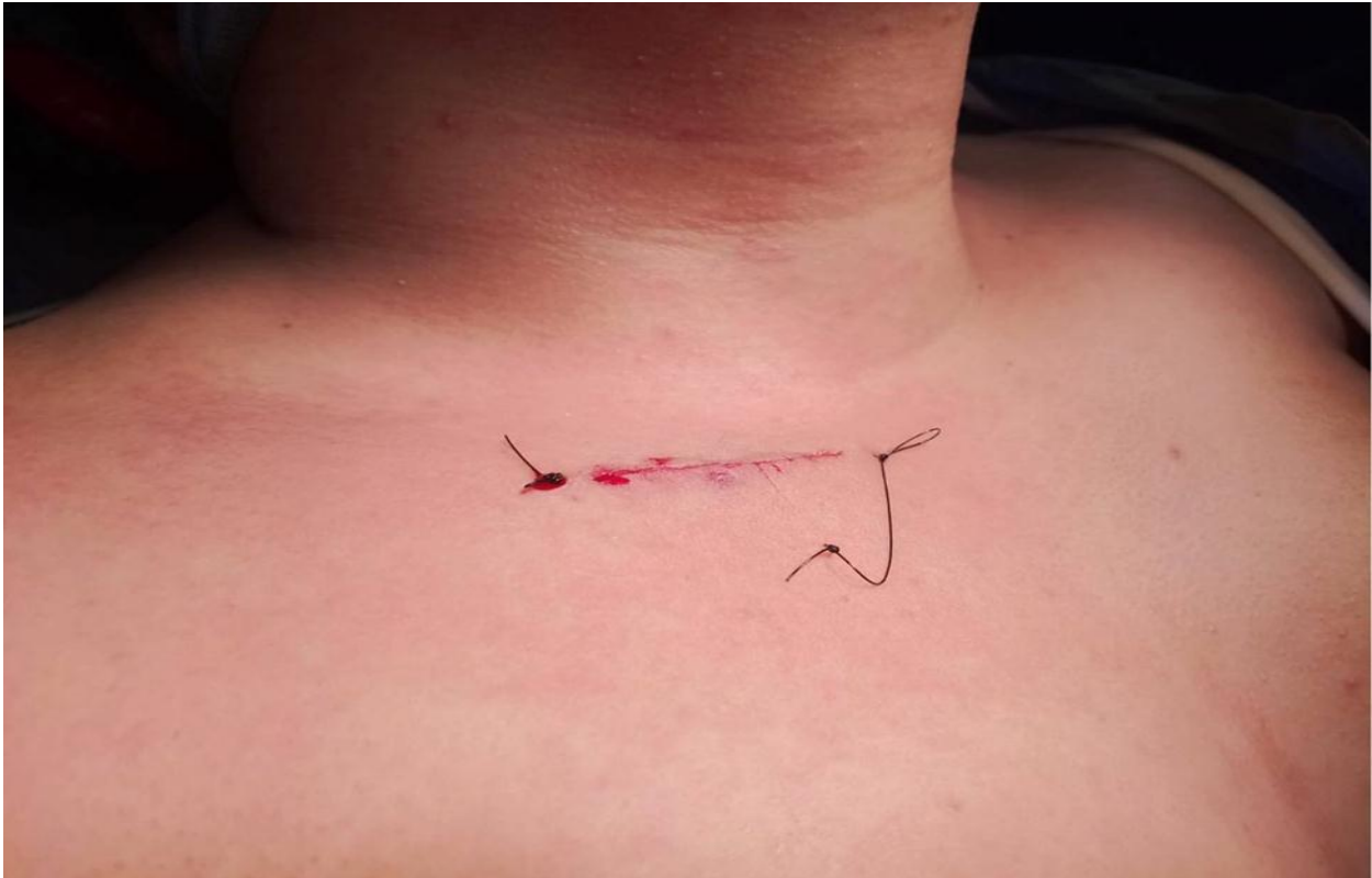
Figure 4. Surgical incision in upper right chest wall