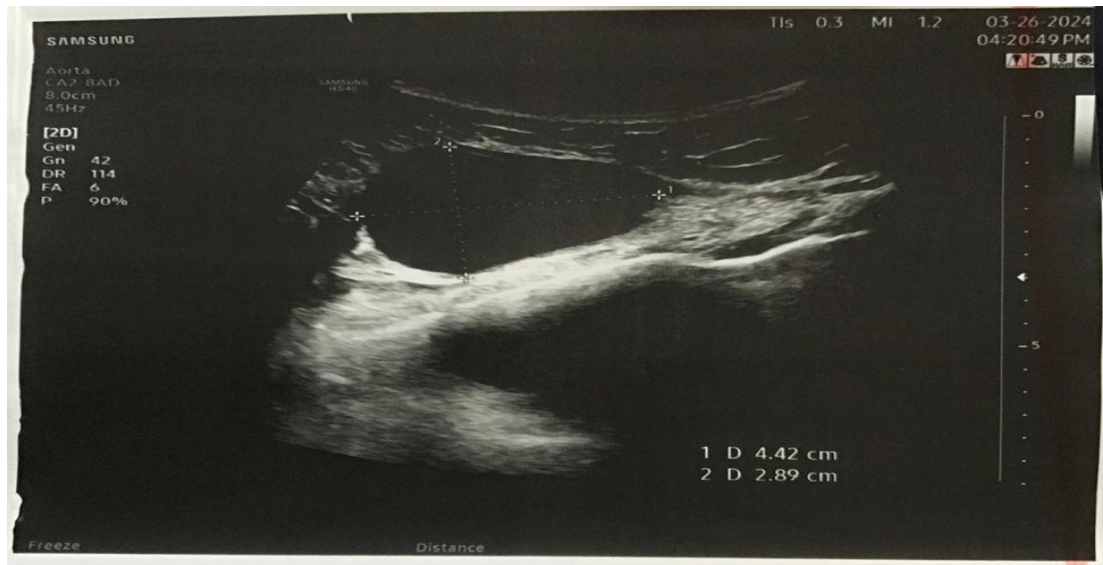
Figure 2. Ultrasound of the chest wall well defined unilocular cyst within muscle below right clavicle