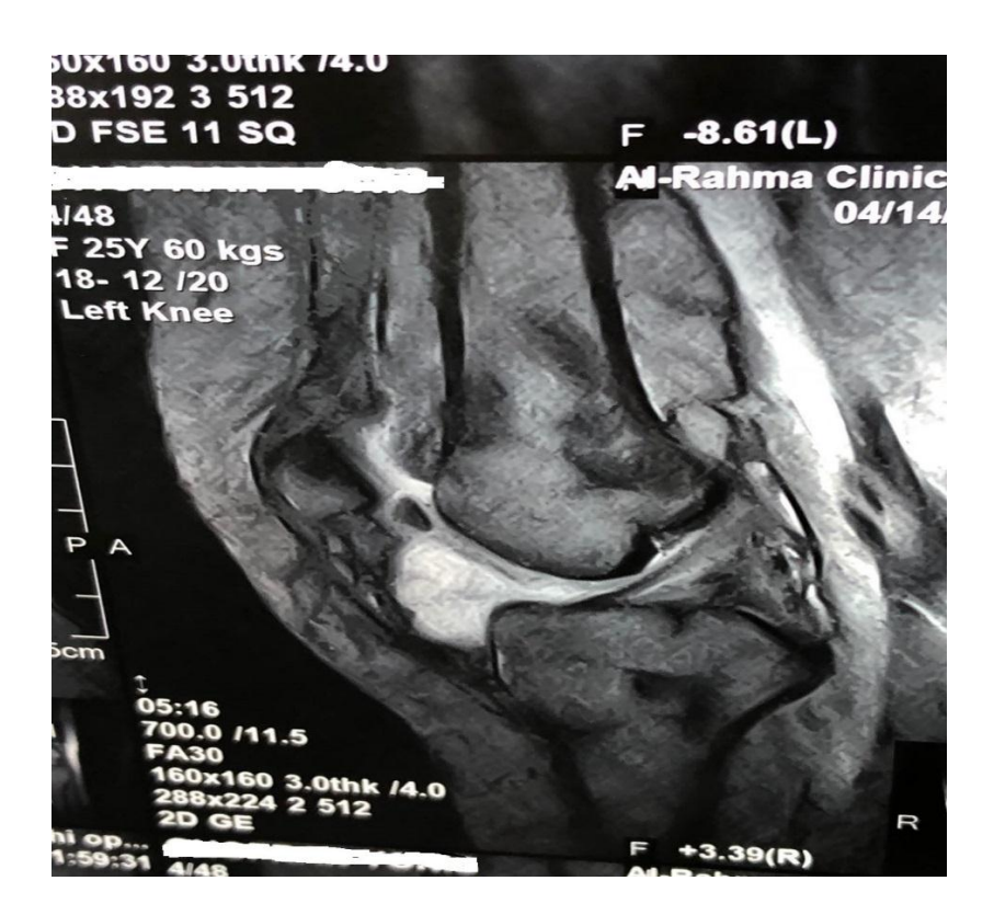
Figure 2. Magnetic resonance imaging of left knee of the patient with intraarticular knee joint ganglion

The ganglionic cyst in this case was large so the decision was to take the patient to open excision to avoid an incomplete removal of the large cyst and to minimize the risk of recurrences compared with arthroscopic resection.