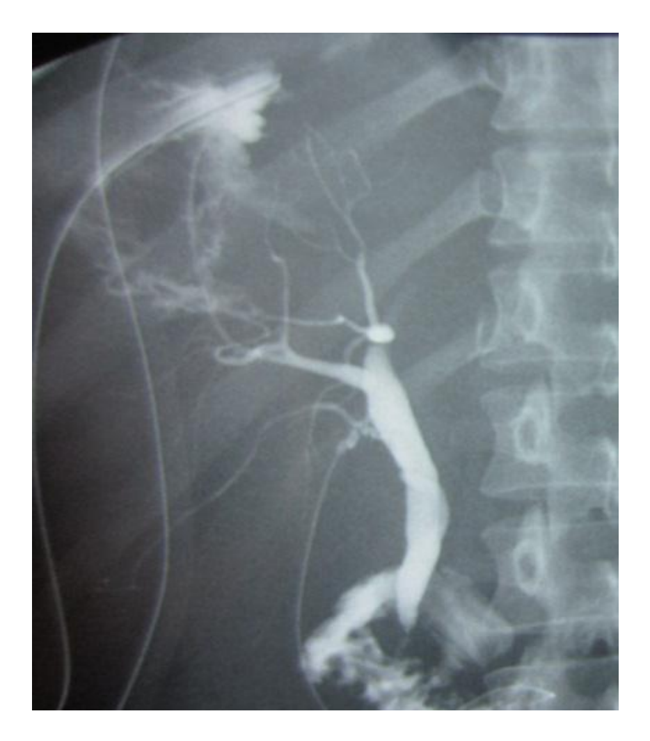
Figure 1. Sinogram shows cysto-biliary communication

this series, the frank and occult CBC were 10.2% and 24.4% subsequently.