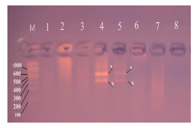
Fig. 2. Detection of NPM1 mutations using Single Strand Confirmatory Polymorphism- RT-PCR in pediatric AML patients. Lanes 1 and 2: control children show absence of hetero duplex formation. Lanes 3, 6, and 7: amplified products from AML children showed absence of hetero duplex formation. Lane 4: positive control OCI/AML3 cell line show hetero duplex formed from mutant and wild type alleles appear as 2 bands (band a app.550 and band

b app. 320 bp). Lane 5: mutated AML patients show hetero duplex formation from mutant and wild-type allele of NPM1 gene, arrows a and b. Lanes 8: negative control (no template). M: Molecular weight marker (DNA ladder). Electrophoresis was carried in 3% agarose gel at (4V/cm) for 120 min.