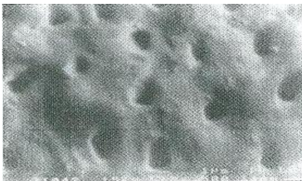
Figure 3. Scanning electron microphotographs showing an area of dentin not treated with Sensodyne (Group B).

While the SEM analysis for specimens of group B showed the dentin surface free of any deposits and the dentinal tubules orifices were patent (Figure 3).