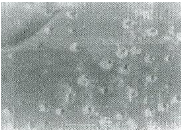
Figure 2. Scanning electron microphotographs showing an area of dentin treated with Sensodyne (Group A).

The scanning electron microscopic analysis showed many deposits on the dentin surface in and around the orifices of the dentinal tubules for specimens of group A (Figure 2).