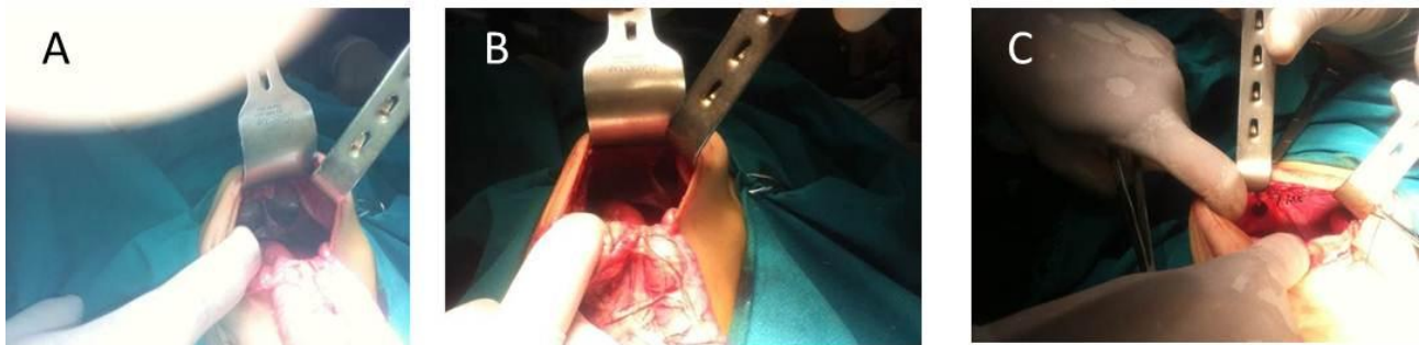
Figure 2. A & B Intraoperative bilateral Morgagni hernia, C Repair of Morgagni hernia