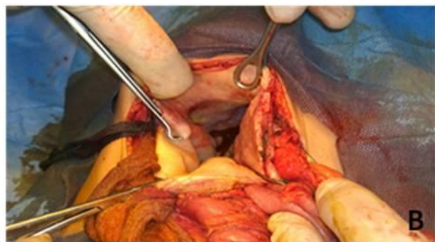
Fig. 2. Intraoperative retroperitoneal Hydatid cyst (Exploration of the cyst); A: Gross appearance of a whitish cyst measuring 11cmx 16 cm, B: cystotomy and partial cystectomy.