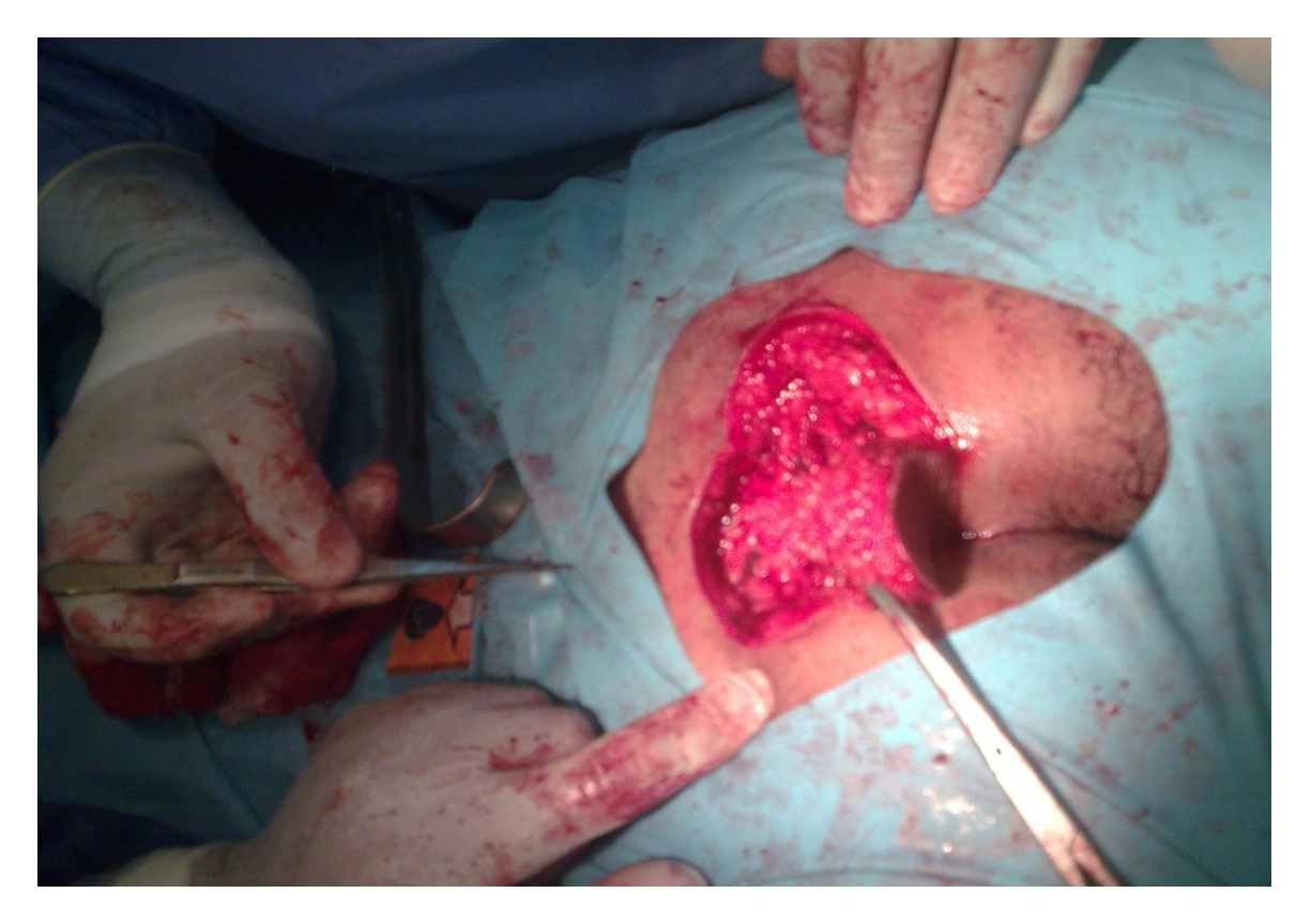
Fig. 3. After hemostasis the flap ready for rotation and defect closure