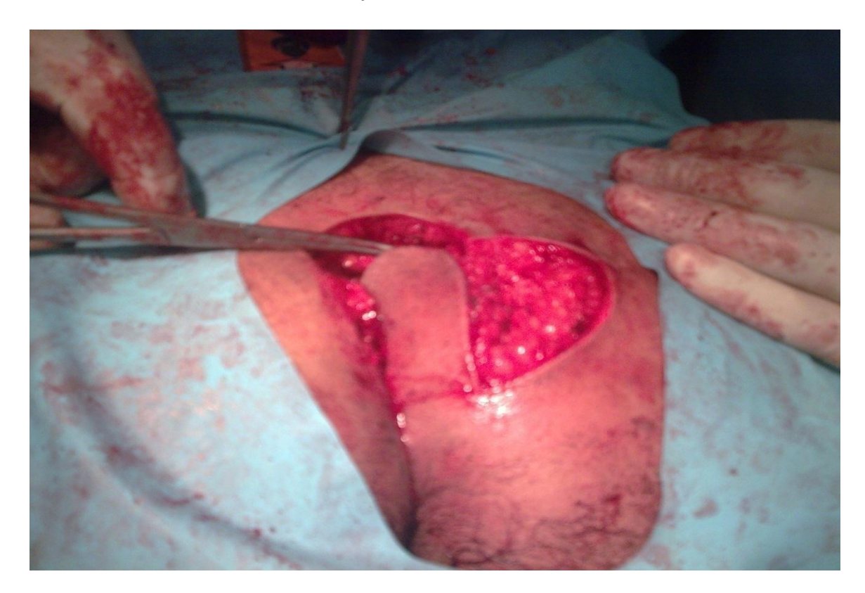
Fig. 2. The sinus bearing area excised and adjacent flap with its sufficient pedicle mobilized to cover the defect