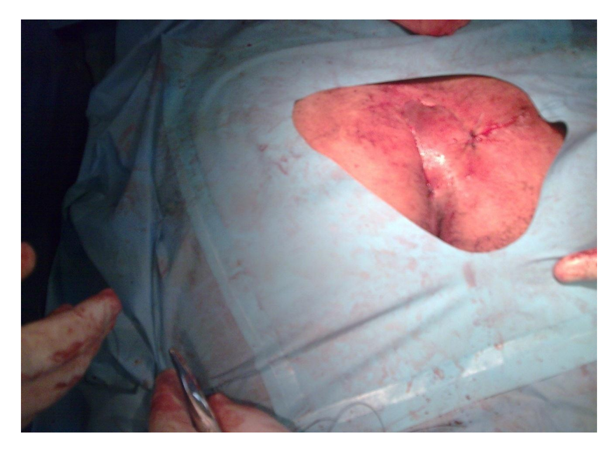
Fig. 4. The end of the end result of surgery the defect created closed by adjacent flap and the gluteal defect closed by direct suture the edge of the skin